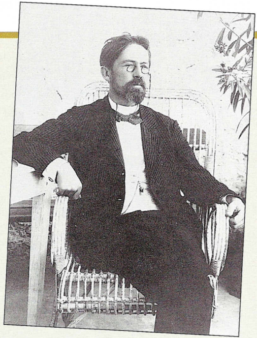
Anton Chekhov in Yalta at the beginning of the 1900s.

of his short life, knowing he was dying from tuberculosis, Chekhov wrote five full-length plays, all dealing in some way with the theme of loss. Four of them are considered masterpieces of realistic drama: The Sea Gull , Uncle