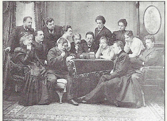
Anton Chekhov reads his play The Sea Gull to the actors of the Art Theater.