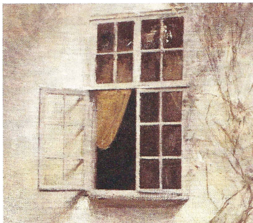
The Verandah at Liselund (detail) (1916) by Peter Ilsted. Oil on canvas.

“The death penalty is more humane than imprisonment for life.”