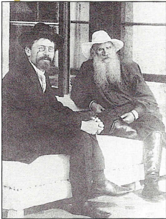
Anton Chekhov and Leo Tolstoy.

“ ‘What is the meaning of life?’ Olga [his wife] once asked in a letter . . . Chekhov replied: ‘It is like asking what a carrot is. A carrot is a carrot and nothing more is known.’ ”